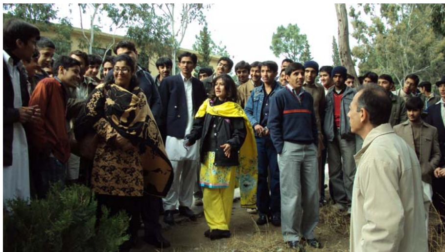
Figure 6: Briefing during Nature Walk