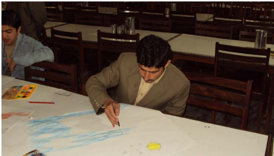
Figure 10: Art Competition