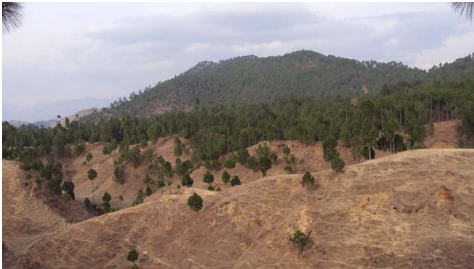
Figure 9: Snapshot Competition