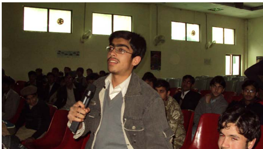
Figure 7: Quiz competition