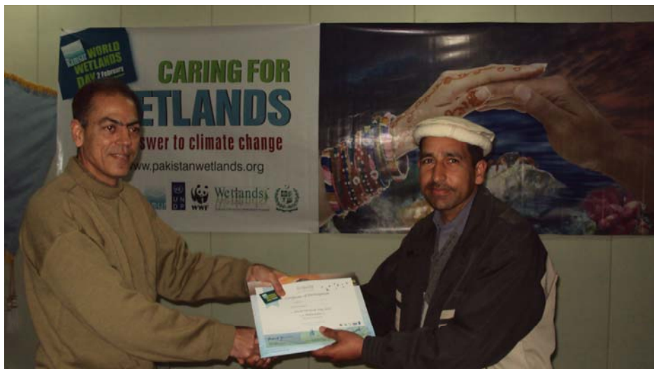
Figure 11: Certificate Distribution Ceremony