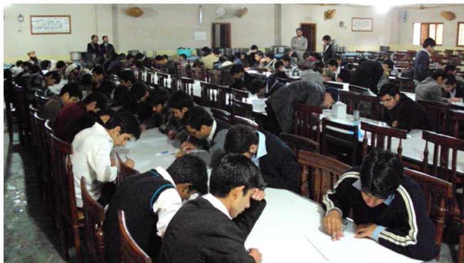
Figure 8: Essay Competition